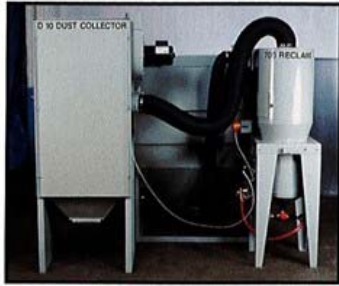
RECLAIMER AND DUST COLLECTOR