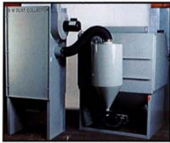
RECLAIMER AND D10 DUST COLLECTOR