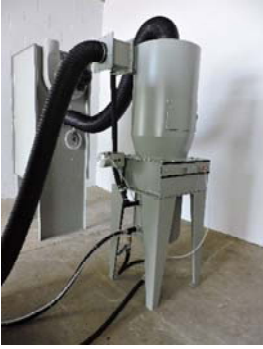
RECLAIMER AND D10 DUST COLLECTOR