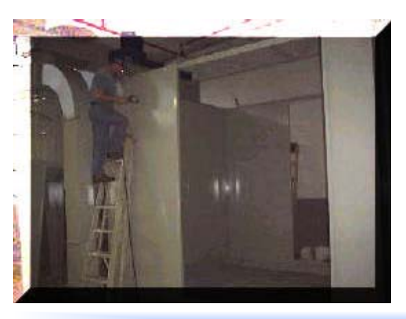
TOP ANGLE & WALL PANEL