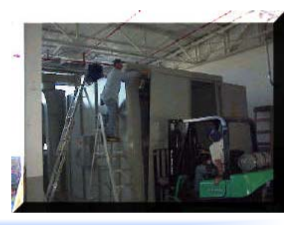
HANGING FRONT DOOR