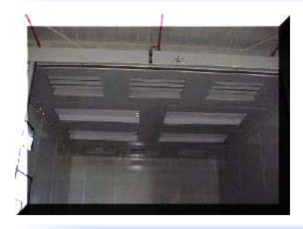
FRONT CATCH & SAFETY