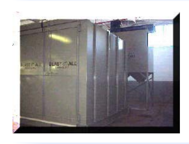
RIDE SIDE OF ROOM